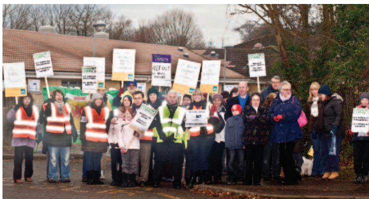
Members at Danescourt Primary School take strike action.

Whilst matters are still ongoing, the campaign that has been built by the members has been extremely successful gaining extensive support from the local community including parents and pupils, with two ex-headteachers of the school visiting the picket line to show their solidarity.