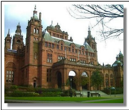
Glasgow's world famous and newly re-furbished Kelvin Grove Art Gallery & Museum